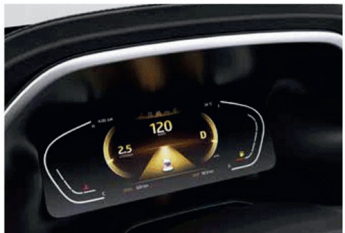
7" driver information cluster