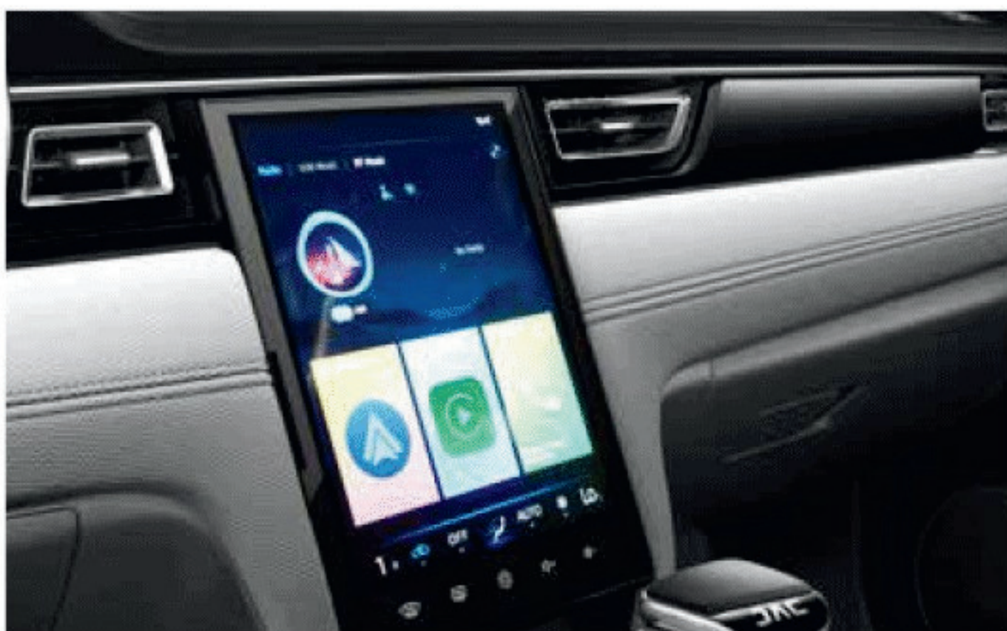
10.4" Touch screen